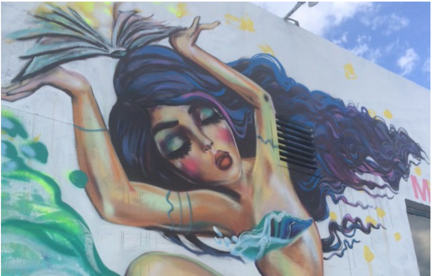
Scene from Three Muses