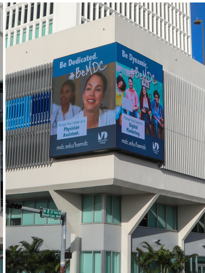
View across intersection