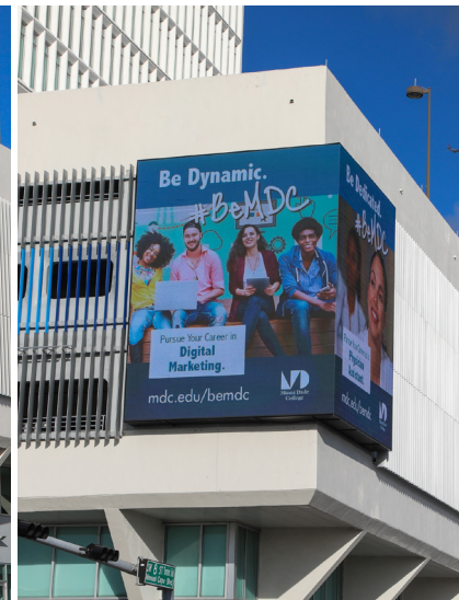
View from 27th Ave