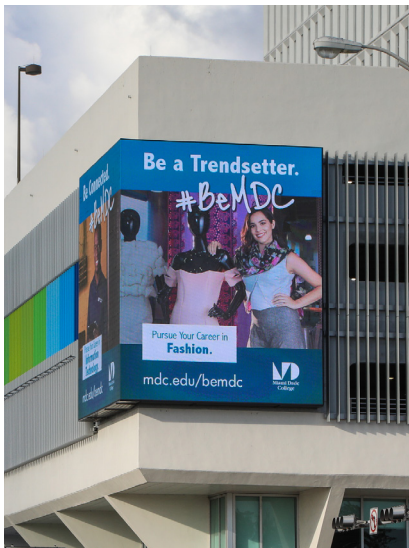
View from 8th St

The billboard has an LED screen that wraps around the corner of the building, with one screen facing SW 27th Avenue and one facing 8th Street. When driving down Southwest 8th Street or 27th Avenue, depending on the viewer's location, only one screen of the billboard may be visible. For maximum visibility and legibility from all angles of the intersection, all content should be duplicated on both screens.